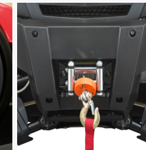
2500 LB WINCH