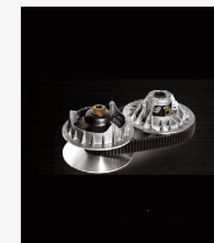
CVT TECH TRAILBLOC