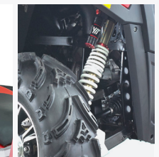
GAS ASSISTED SHOCKS